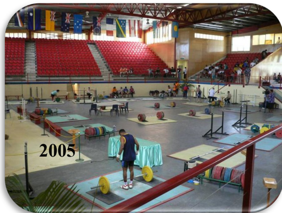
The Samoan Minister for the 2007 Pacific Games The Hon. Faumuina Tiatia Liuga opens the Weightlifting Institute in Samoa